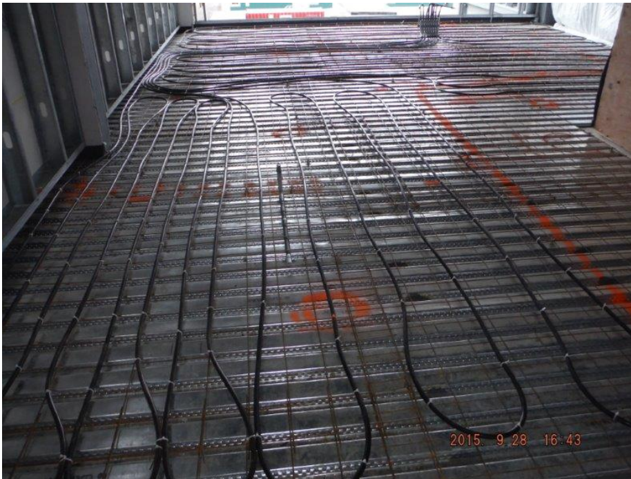
Installation of in slab heating pipes