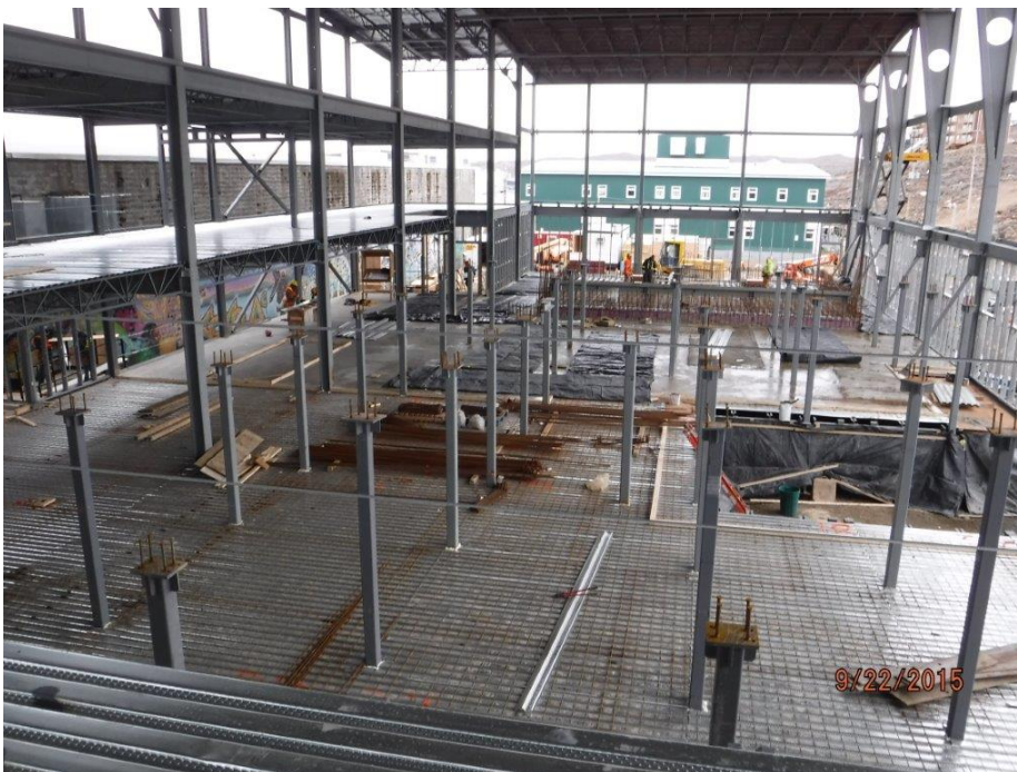
View of the pool area with the leisure pool in foreground and lap pool in background