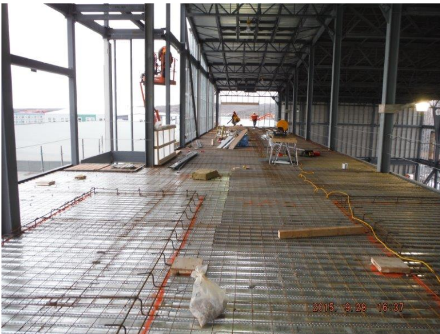
View of the 3 rd floor mechanical level