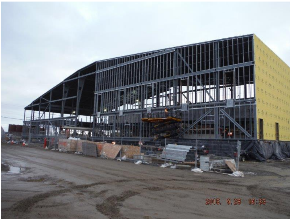
Buidling elevation along Kangik & Iniq Drive