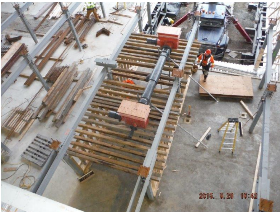
Positioning of pool drains and piping supported by false work