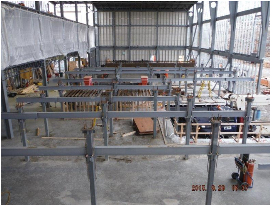
View of the pool mechanical floor and structural columns that will support the pool