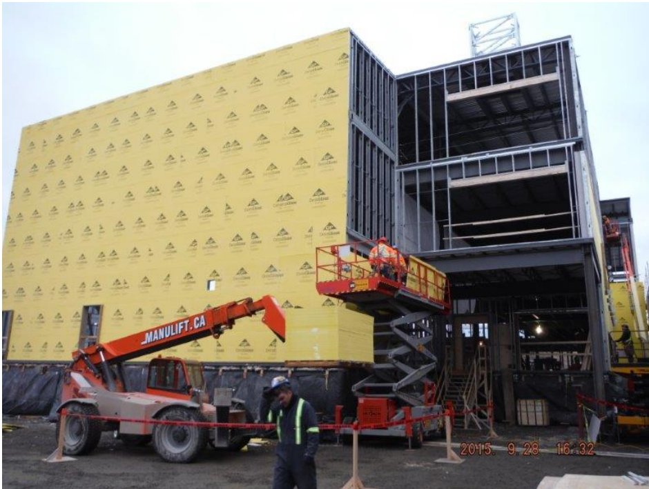
View of the building entry from the visitor parking